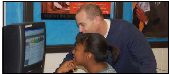
At Sophomore Workshop on Dec.13, 2008

For more event pictures and other CB information, visit us on the web at